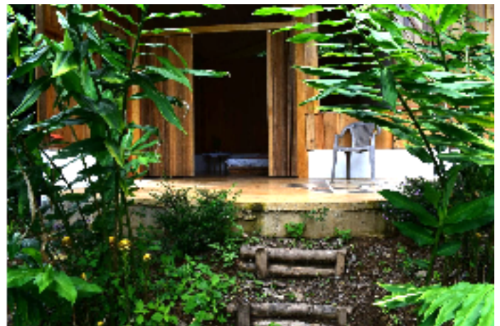
View of private balcony in Mandala Room