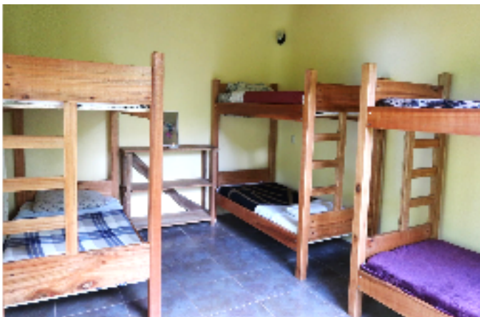
Bunks in the Mango Complex

The Mango Complex has an assortment of rooms that can be made into private or shared accommodations. Each room has a private sink with running water.