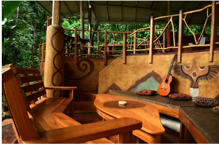
Living Room in Hosting Center Kitchen

Our spacious hosting center has a large, fully equipped kitchen and our beautiful cabins can accommodate up to 30 people with many more spaces for camping.